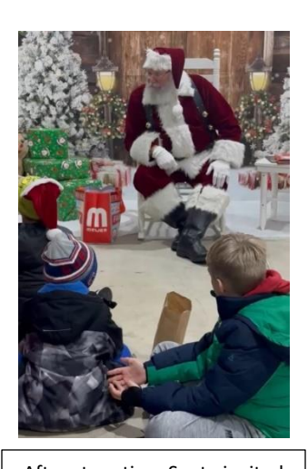
After story time Santa invited the children to ask him questions. Although some might have seemed tricky, Santa answered them all tactfully while always smiling and laughing.

wishes from the Christmas list of each child.