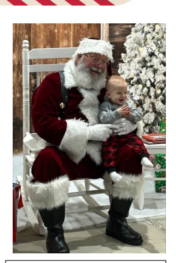
Even our tiny guest had fun sitting on Santa's lap.