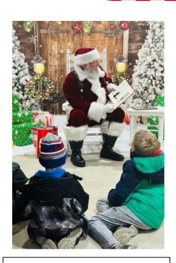
Santa had brought the book The Night Before Christmas to read to the boys and girls. It was fun to hear Santa tell the story himself.